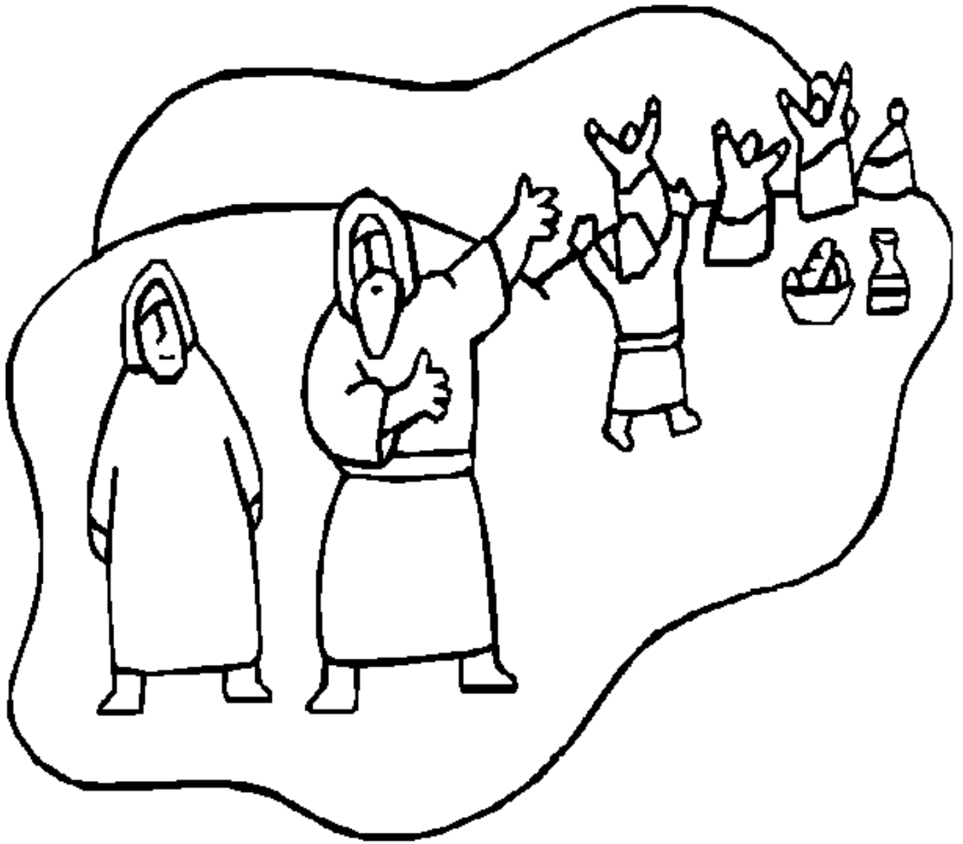
The prodigal son comes home.