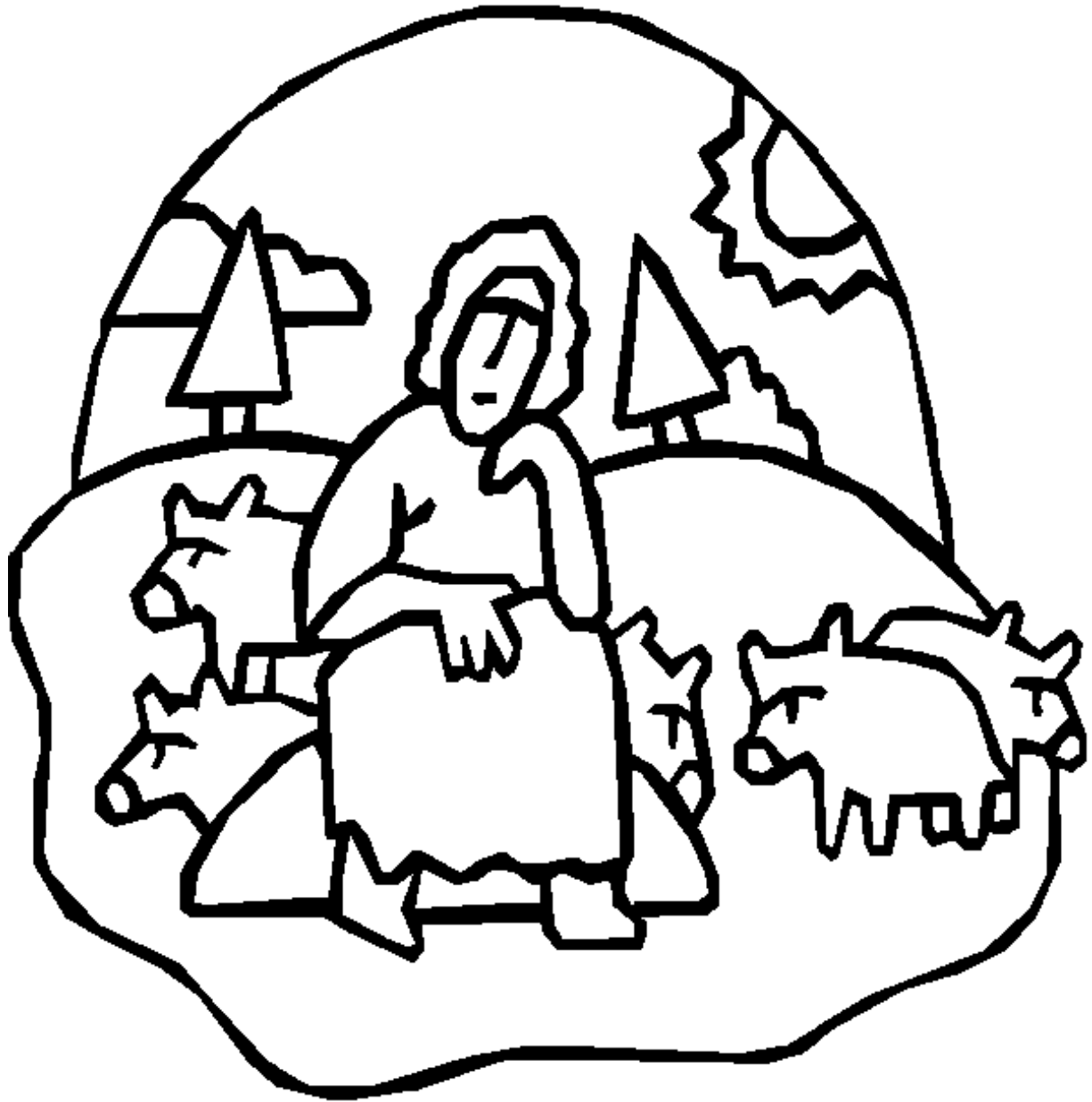
The prodigal son lives with pigs