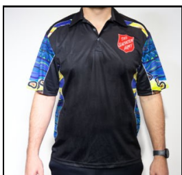
Indigenous Polo shirt

http://thetrade.salvos.org.au/catalogue/search/reconciliation/