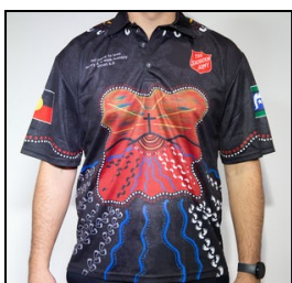
Reconciliation Painting Polo shirt -