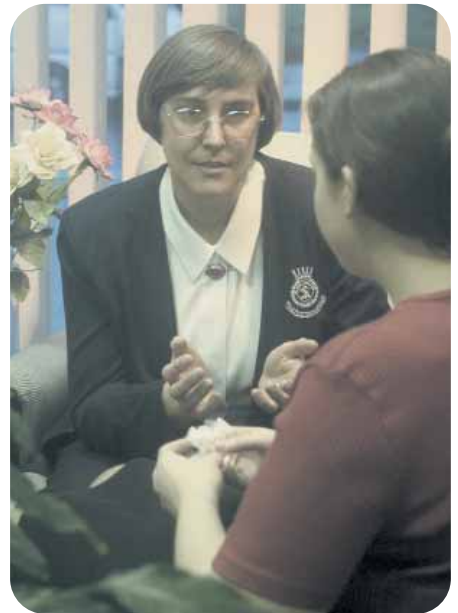
TALKING, OR COUNSELLING MAY ASSIST IN RECOVERY

If a child continues to demonstrate changes in behaviour, it may be necessary to seek professional help (see final section of this booklet).