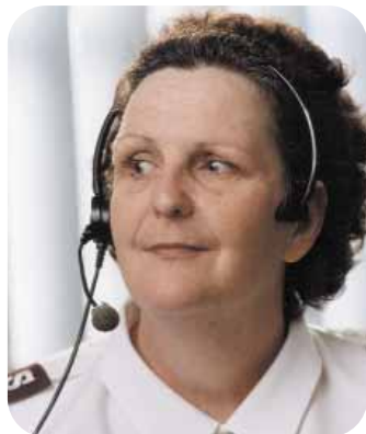
RIGHT SALVO CARE LINE