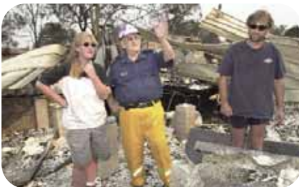
ABOVE MAJOR DISASTERS ARE EXAMPLES OF CRITICAL INCIDENTS