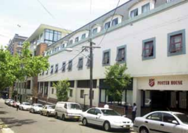
Foster House, Sydney, NSW