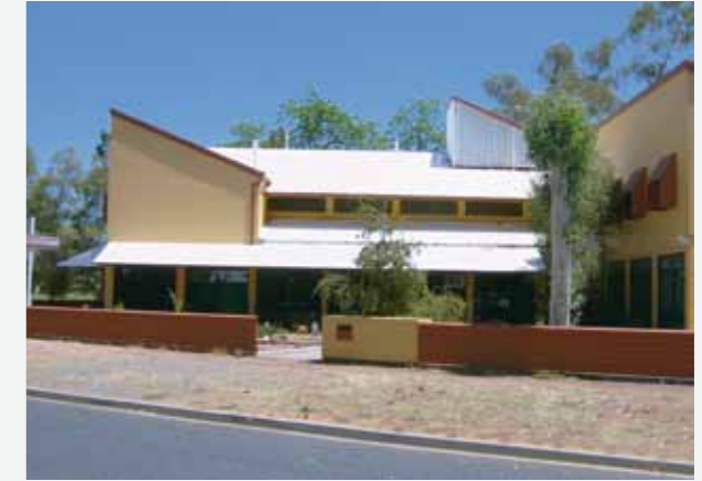
Alice Springs Men's Hostel, NT