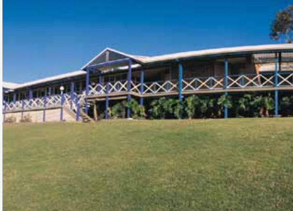
Collaroy Centre, NSW