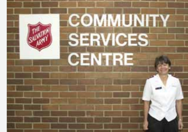
Canberra Community Welfare Centre, ACT