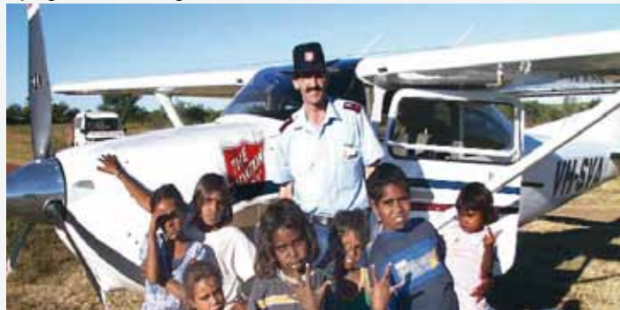
Flying Padre visiting remote communities