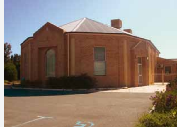
The Salvation Army Heathridge Corps, WA, Church and Community Centre