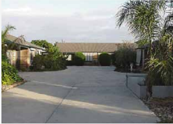
Centennial Court, SA helping individuals with intellectual disabilities cope in society