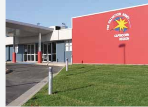
Capricorn Region, Qld