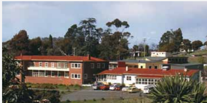
Bridge Centre, Hobart, TAS