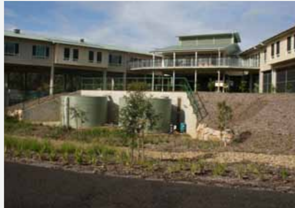
Riverview Gardens Aged Care Services, Qld