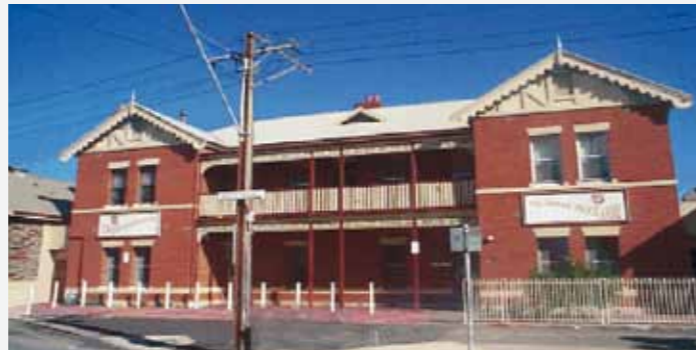
Whitmore House, Drug & Alcohol Outreach & Transitional Support Program, SA