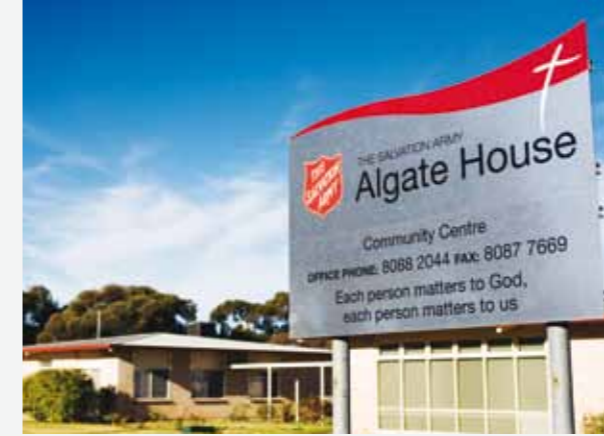
Algate House, Broken Hill, NSW