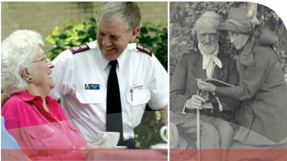
ABOVE, L TO R: AGED CARE IS STILL AN IMPORTANT PART OF THE SALVOS' WORK – WE'VE BEEN IN AGED CARE MORE THAN 100 YEARS.

The Salvation Army Australia Eastern Territory has announced a $300 million redevelopment of its Aged Care capital works programs across NSW, Queensland and the ACT.